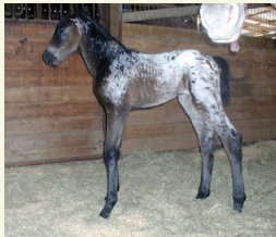
Macarn Farm's second generation of Knabstrupper foals began with the birth of Tzarina by Apollon on March 28, 2006.

Cassel Rock Trakehners welcomes three new foals: