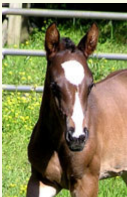
Resonance, by Tanzeln out of Riante by Sigurd dark bay trakehner colt born 4/14/06 (3 weeks early).

exposure planned, this is a GREAT time for member breeders to list their horses for sale on our FREE website listings! Please get them in!