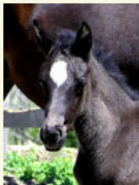
Fiana, by Tanzeln out of Fun 'n Games by Fabius, black 3/4 trakehner filly born 3/26/06.