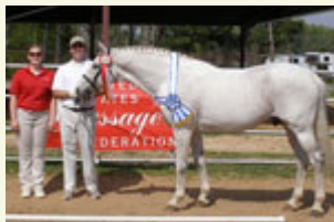
Right behind him was Silver Lining as Reserve Champion Mature Stallion at the Arkansas Show and Reserve Champion Special Hunter at the Tulsa Spring Go Show.